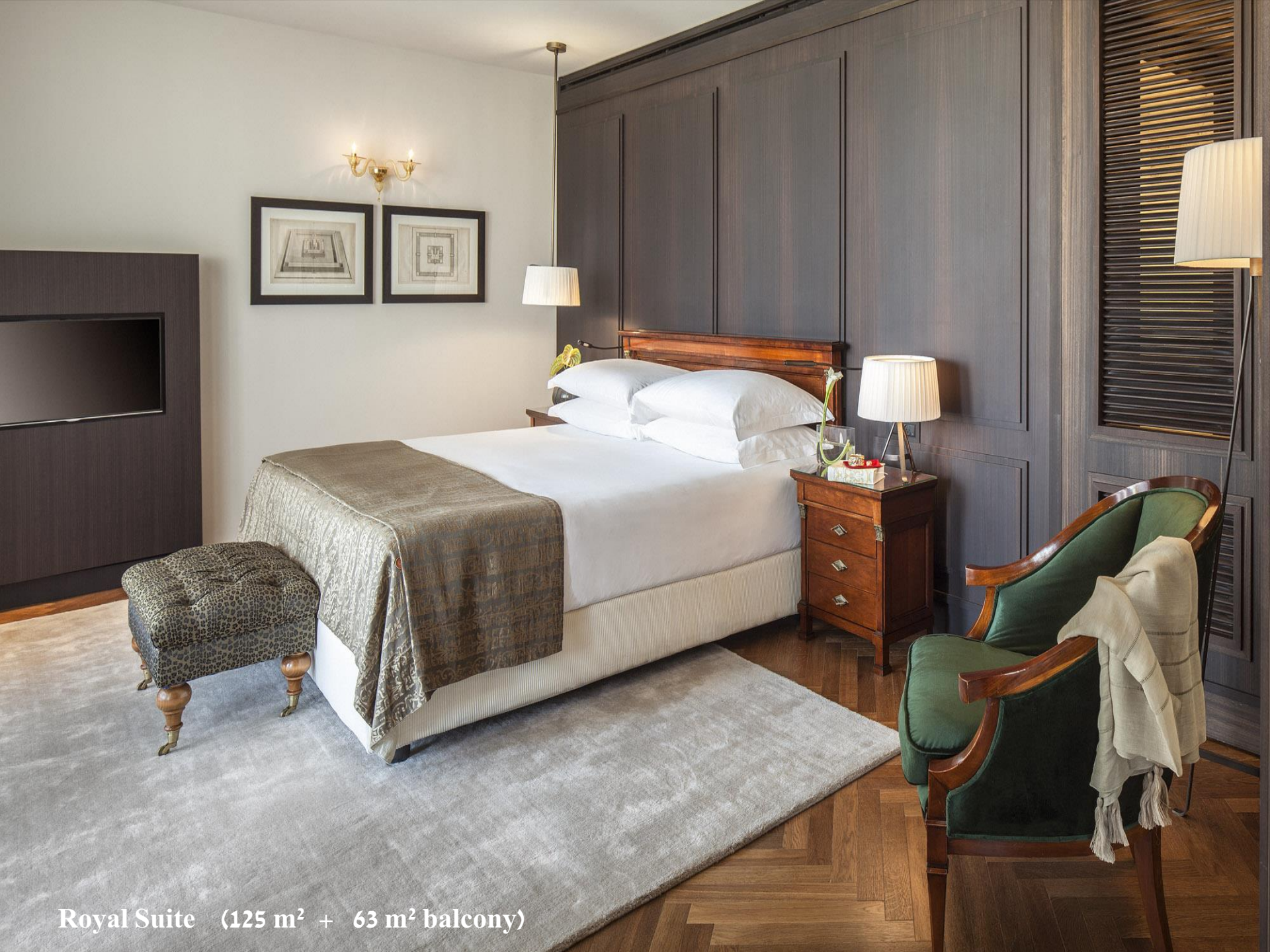
Royal Suite (125 m 2 + 63 m 2 balcony)