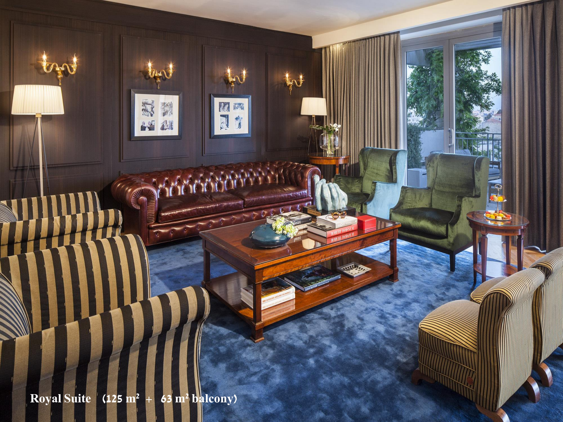
Royal Suite (125 m 2 + 63 m 2 balcony)