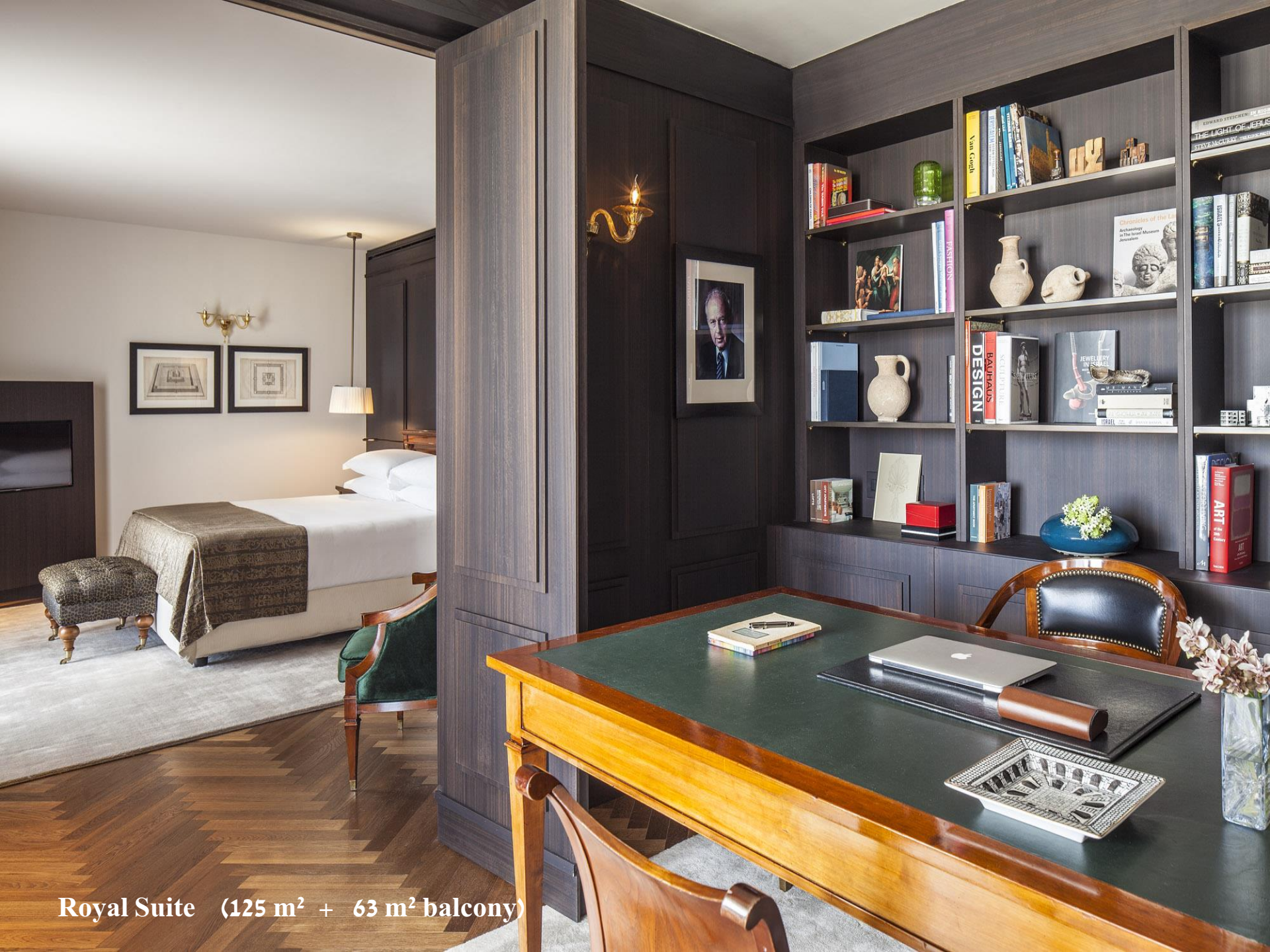
Royal Suite (125 m 2 + 63 m 2 balcony)